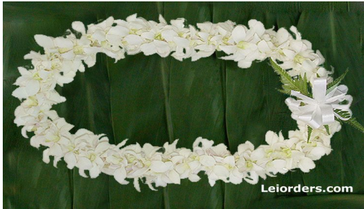
Double White Orchid

Pre-Order: Please indicate number of Luxury Leis.