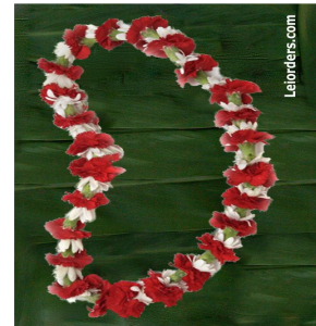
Red Carnation/White Orchid