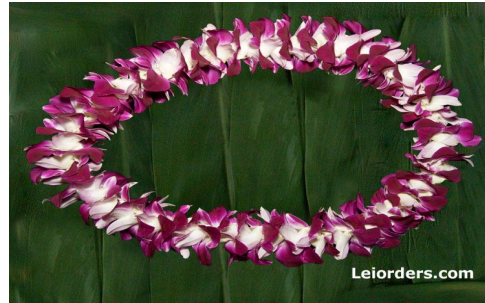
Double Purple Orchid