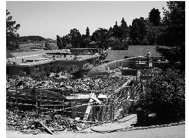
The final stage of demolition of the Keyser Building is seen in this photo taken over the summer.

On August 15, Superintendent Ferguson met with the Site Committee and City representatives to discuss how the District will comply with DSA's requirement to provide accessibility to the campus. After researching options and meeting with DSA officials, the District has determined that the only viable option that meets State codes is the use of an elevator. The Superintendent proposed locating an elevator tower/bridge structure across from the new Keyser Hall site. The bridge would connect to a path of travel that runs the length of the Campus at the 25-foot elevation. The District has requested architectural concepts for the Site Committee to review. This proposal will require final approval by DSA.