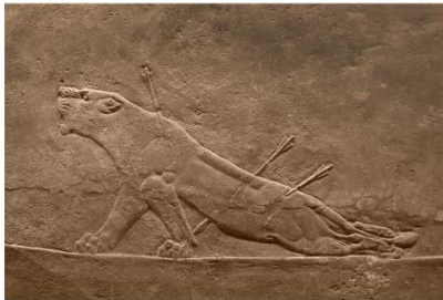
The Dying Lioness From the north palace of Ashurbanipal, Nineveh Assyria ca. 645