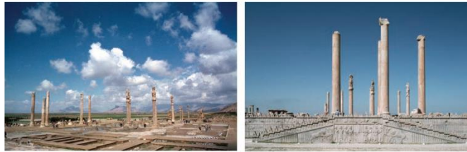
Audience Hall (apadana) of Darius and Xerxes Persepolis, Iran. Persian. c. 520-465 BCE. Limestone.

NEO-BABYLONIAN & ACHAEMINID PERSIA 604-559 BCE