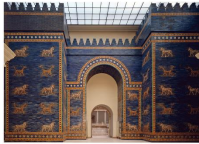
The Ishtar Gate Babylon ca. 575