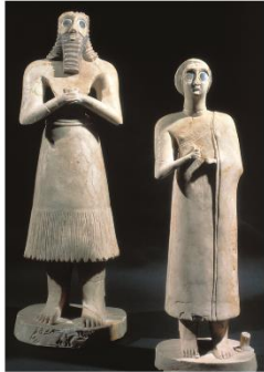
AP The Eshnunna Statuettes Sumer ca. 2700 BCE Notes: