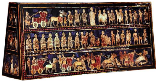
AP The Royal Standard of Ur Sumer c. 2600 BCE Notes: