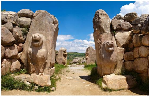
The Lion Gate Hattusa Hittite ca. 1400