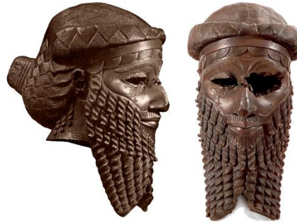
Head of an Akkadian Ruler Akkad ca. 2250-2200 BCE Notes: