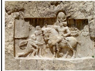
Triumph of Shapur I over the Roman Emperor Valerian Rock-cut relief Bishapur, Iran ca. 260 CE