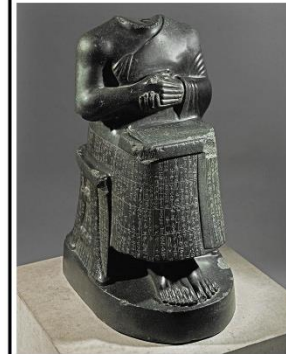
Gudea seated, holding the plan of a temple Neo-Sumerian ca 2100 BCE. Notes: