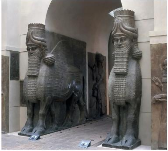
AP Lamassu Assyria ca. 720-705 BCE, alabaster