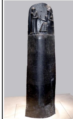
AP The Stele of Hammurabi Babylonia, ca 1760 Notes: